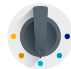
5 FLOOR SETTINGS